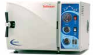
Manual Table-Top Autoclaves

Tuttnauer USA Co. 25 Power Drive, Hauppauge, NY 11788 Tel: +800 624 5836, +631 737 4850 Fax: +631 737 1034 E-mail: info@tuttnauerUSA.com www.tuttnauerUSA.com