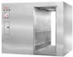
Large Capacity Sterilizers for Medical Use

Featuring Tuttnauer's range of cleaning, disinfection and sterilization solutions