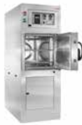
Horizontal Steam Sterilizers for Laboratory & Scientific Applications